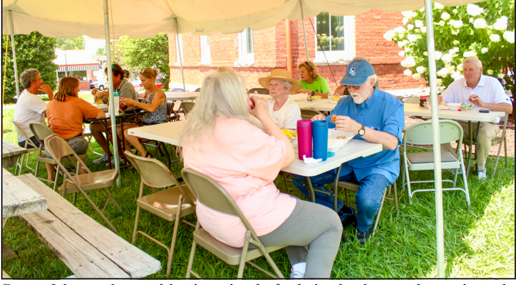
Guests of the courthouse celebration enjoyed a fundraiser luncheon outdoors prior to the speaking portion of the Historical Society's birthday event.

Here's to another century and, hopefully, many more to come