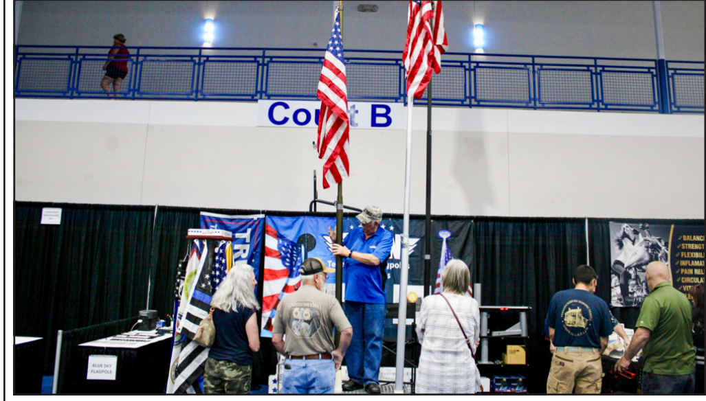
Blue Sky Flagpole out of Hendersonville, North Carolina, set up a patriotic display for the Home & Garden Show in Young Harris over the weekend.

While Expo Manag-See Home & Garden, Page 7A