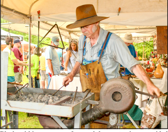
Blacksmithing was one of several demonstrations provided as entertainment for the shopping public at the Butternut Creek Festival Saturday and Sunday.