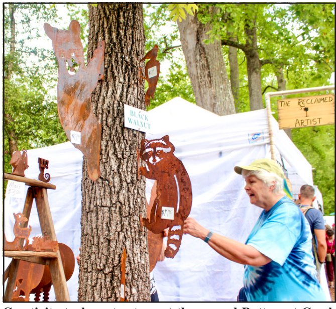
Creativity took centerstage at the annual Butternut Creek Festival over the weekend, featuring tons of fun artwork like these metal woodland creatures inside Meeks Park.